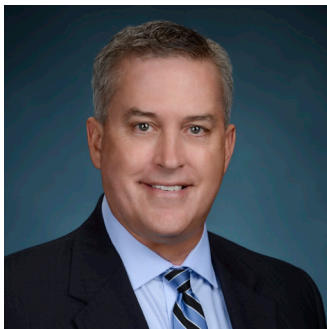
Drew Clayton Securities Litigation