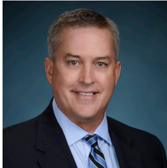
Drew Clayton Securities Litigation